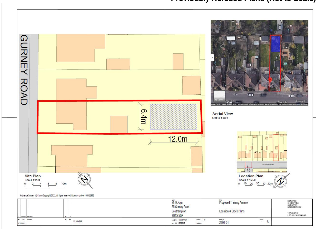
Appendix 4 Previously Refused Plans (Not to Scale)